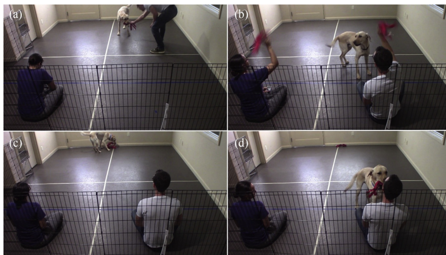
Figure 1. A depiction of the experimental set-up and procedure. In all panels, the bystander appears on the left and the player appears on the right. Both experimenter role (player versus bystander) and the side of the room each experimenter sat on were balanced between subjects. (a) During the 45 s play period at the beginning of each trial, one experimenter (the player) engaged the subject in a social game designed to elicit coordinated joint activity while a second experimenter (the bystander) remained seated and ignored the subject. (b) At the conclusion of the play period, both the player and bystander simultaneously called the subject's attention and threw identical toys to the opposite end of the testing space. (c) During the 30 s interruption period that followed, both experimenters remained seated while attempting to make eye contact with the subject. (d) Here, the subject offered a toy to the player while standing in their lap during the interruption period.

We next coded several measures aimed at capturing possible re-engagement behaviour during the interruption period, taking inspiration from re-engagement measures previously reported in the developmental and comparative literatures (e.g. MacLean & Hare, 2013 ; Tomasello, Carpenter, & Hobson, 2005 ; Tomasello & Moll, 2010 ; Warneken et al., 2006 ): (1) proximity – time in seconds the dog spent near each experimenter, defined as having both front paws within a \sim 3 \times 1.8 m rectangle taped on the floor that each experimenter sat in; (2) physical contact – time in seconds the dog spent with any part of their body touching any part of each experimenter's body; (3) eye contact – time in seconds the dog spent with their snout/eyes directed towards each experimenter's head or shoulders; (4) toy offering – count measure of each time the dog dropped a toy within one arm's length of each experimenter; (5) directed licking – binary measure of whether the dog licked each experimenter at least once during a given trial; (6)