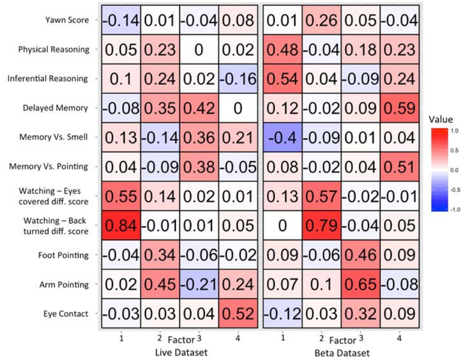
Fig 3. Factor loadings from exploratory factor analyses of the (A) Beta, and (B) Live datasets. Both datasets were best described by four factor models consisting of factors related to gesture comprehension, memory, and cunning, with a fourth factor that varied between the Beta and Live datasets. The order of factors varied between datasets but the following factors resemble one another between analyses (Live PA1 & Beta PA2; Live PA2 & Beta PA3; Live PA3 & Beta PA4). The remaining factors (Live PA4 & Beta PA1) had no clear analog in the other dataset.